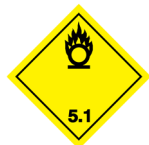
Class 5.1 HAZARD Oxidizing Substances